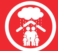
% of households affected by a climatic shock

Climate shocks are associated with a reduction of about 15% of per capita expenditure. In addition, 56% of households in extreme poverty change their food intake to compensate for the economic effects of a climate shock and spend on average 30% less than households that did not experience a shock. This can affect health outcomes and school learning.